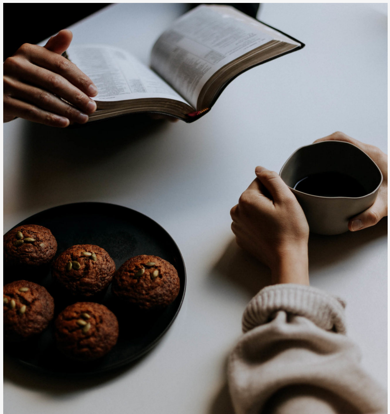
Spring 2023 Network News